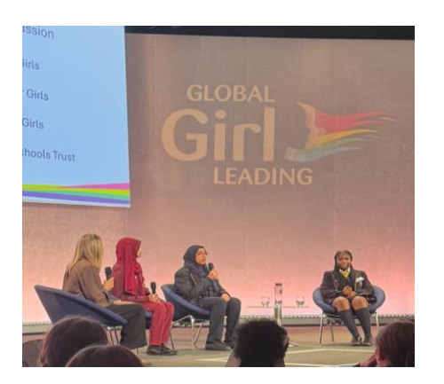
As always, I wish you all a happy weekend.